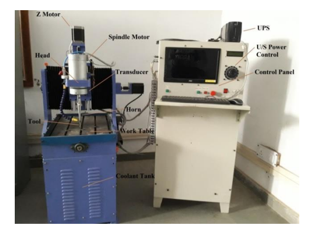
Figure 1: Basic Components of Rotary Ultrasonic Machine