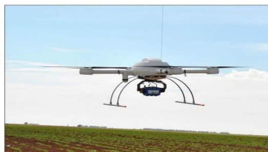
Fig 2: unnamed aerial vehicle (UAV) (7).

UAV's outlook under the remote sensing process and operations, inclusive of the following: drone's, glider's, (quad-, hexa-, octo-) copter's, helicopter's or chopper with human supervision based on a ground level station (remotely piloted aircraft; RPA) or by the means of any aerial vehicle under coordination.