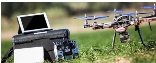
Fig 3: md4 1000 micro drone with its base station the UAV.

The base station, brought about by micro-drones, uses md-cockpit application software to eye track and exercise control on the flights.