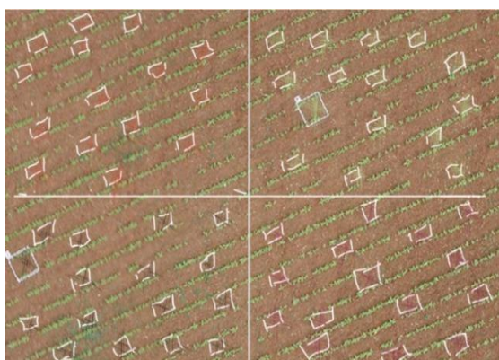
Fig 5: Detail of the file created, in one of the 49 square frames for wheat crop (green) and weed (violet) classes (7).

These frameworks were utilized as an input data to the Leica Photogrammetric Suite 2010, software under the ortho-rectification by the “aero-triangulation and mosaicking”. Camera calibration components were testified and calculated by juxtapose overlapping (9) dimension of one after the other images throughout the aero- triangulation Precision Agric process. Thereafter, the images have been confounded into the seamless ortho-mosaicked picture of each and every corner of the wheat field.