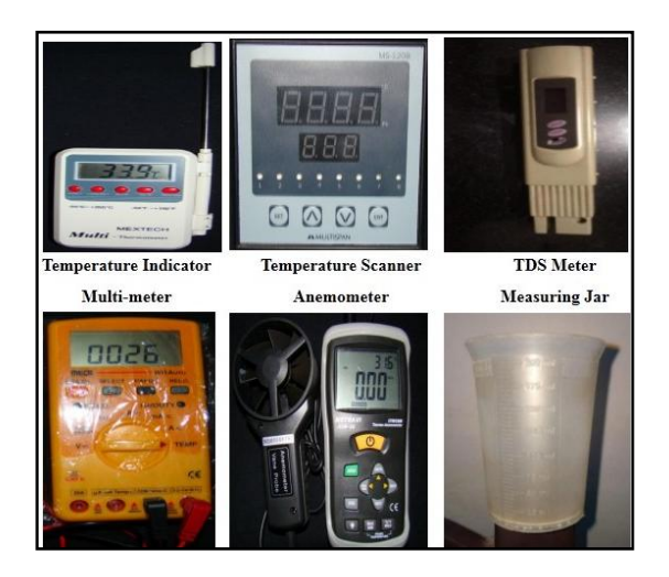
Figure 3: Measuring Instruments

record the data from J-type thermocouple, which are installed in solar still at fixed locations selected by researcher. Total five measuring thermocouple are installed in this setup. All thermocouple are calibrated with hot and cold water bath process. All measuring instrument are present in figure 3 [6,7].