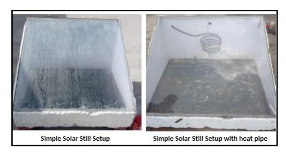
Figure 2: Actual setup of solar still

The setup is made by local available material like MS sheet, thermocol sheet, black paint, glass sheet etc. The setup has 1m^2 surface area in bottom with 26 inclination angle for glass sheet and the real images of a simple solar still and solar still with heat pipe is present in figure 2. Heat pipe is made of cu circular tube having mechanical pump for coolant fluid circulation. For collection of purified water, trench is made using sheet metal plate.